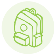
Before-and-after school programs